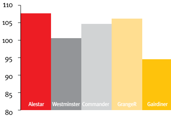
Sth West Victoria MET NVT Data